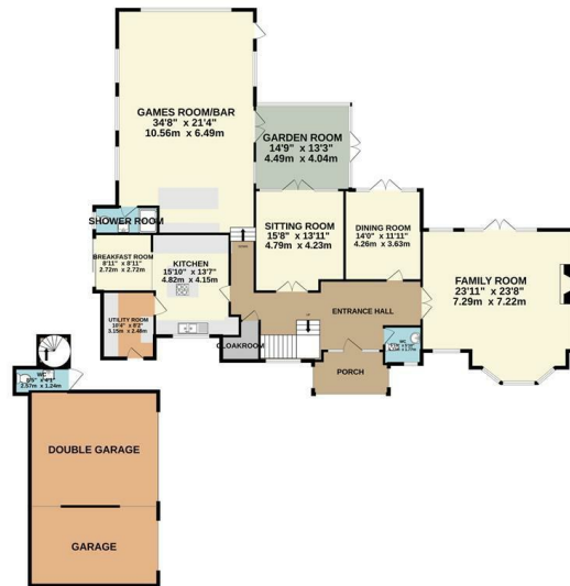
GROUND FLOOR 3267 sq.ft. (303.5 sq.m.) approx.